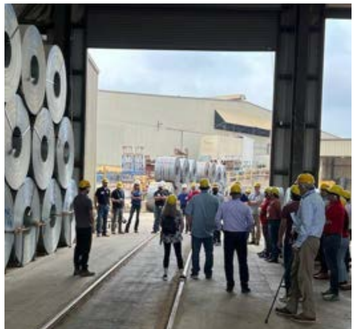
Visiting our manufacturing partners, Priefert, at their Mt. Pleasant, TX facility.

TRACE utilizes a 3D model of the solar site to determine optimal tracking schedules before construction begins, allowing for more accurate predictive energy modeling. Additionally, weather sensors respond to real-time changes in weather conditions, stowing for wind, snow, etc., and altering row rotations as needed. Nevados' controls optimize the energy production on terrain and protect the system from environmental conditions. The best part? It does all of this automatically and autonomously.